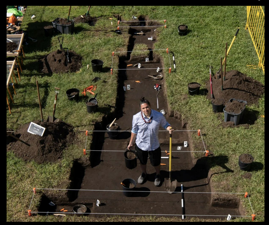
Shadow on the Land, an excavation and bush burial. A commentary on taking down racist monuments. Nicholas Galanin, 2020